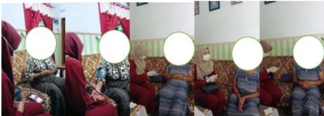
Figure 1. Activity Documentation

The documentation of research activities conducted over three days is presented to demonstrate the involvement of both respondents and researchers throughout each stage of the intervention. This documentation serves as empirical evidence and reinforces the validity of the research findings. For example, it can be seen in Figure 1.