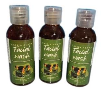
Figure 1. Ketepeng leaf extract gel facial wash

Gel facial wash preparation of ketepeng leaf extract was made in 3 formulas, namely formula 1 (2% ketepeng leaf extract facial wash), formula 2 (4% ketepeng leaf extract facial wash), and formula 3 (8% ketepeng leaf extract facial wash).